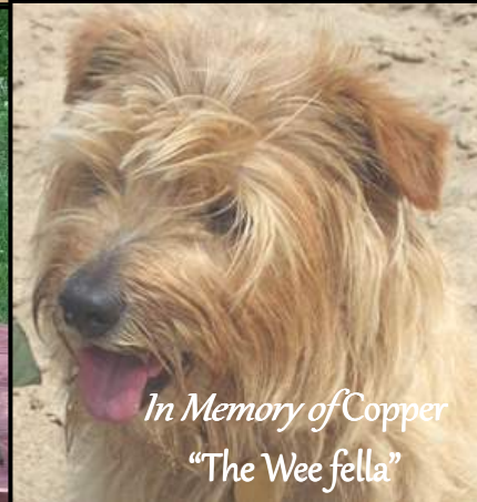
In Memory of Copper "The Wee fella"

Thank you to all those that braved the weather turning out to support the official opening. Since then, somewhat overwhelmingly! - every conceivable shape, size and breed of dog has come with their owners, from far and wide to use the trail - often alongside it finding our wonderful park for the first time. A massive thank you to everyone for all your hard work, dedication and support to produce such an outstanding addition to the park. We could not have done it without you. Zoe