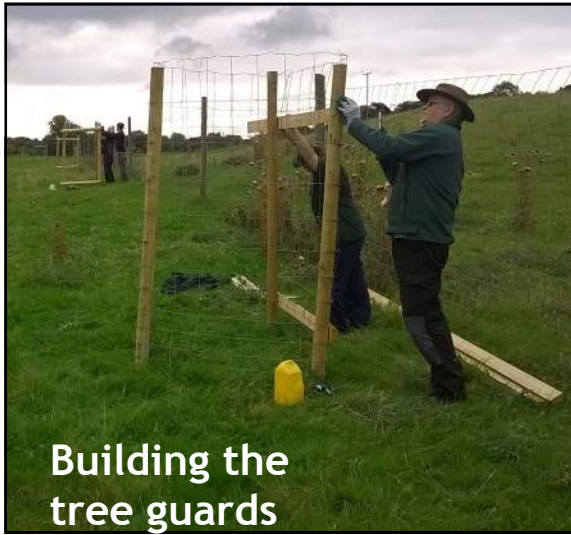
Building the tree guards